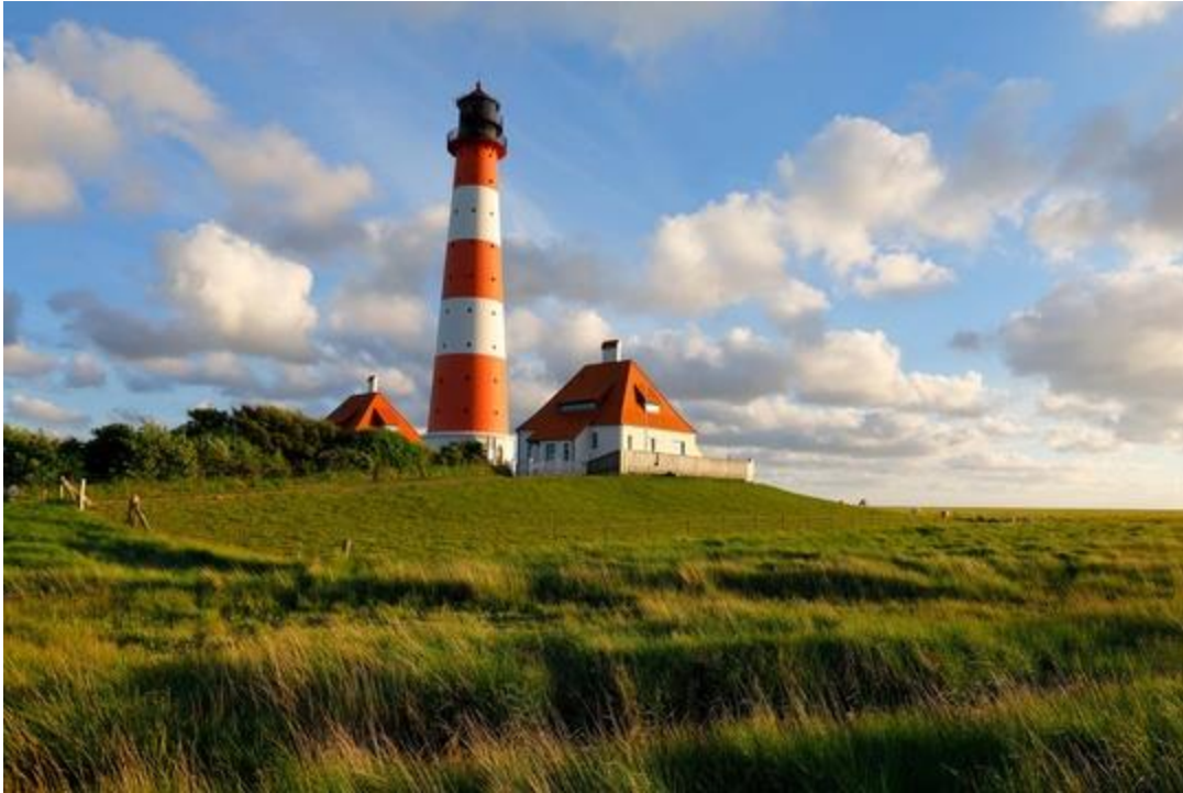
Lighthouse of Westerhever, Westerhever, Schleswig-Holstein, Germany