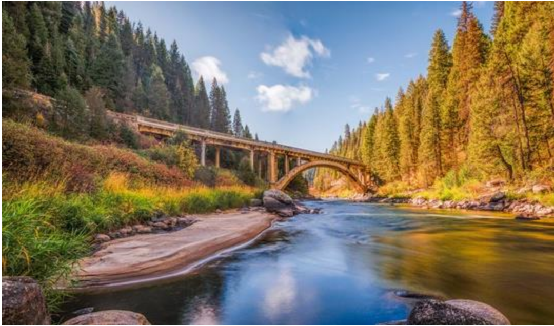
Rainbow Bridge, Smiths Ferry, Idaho.