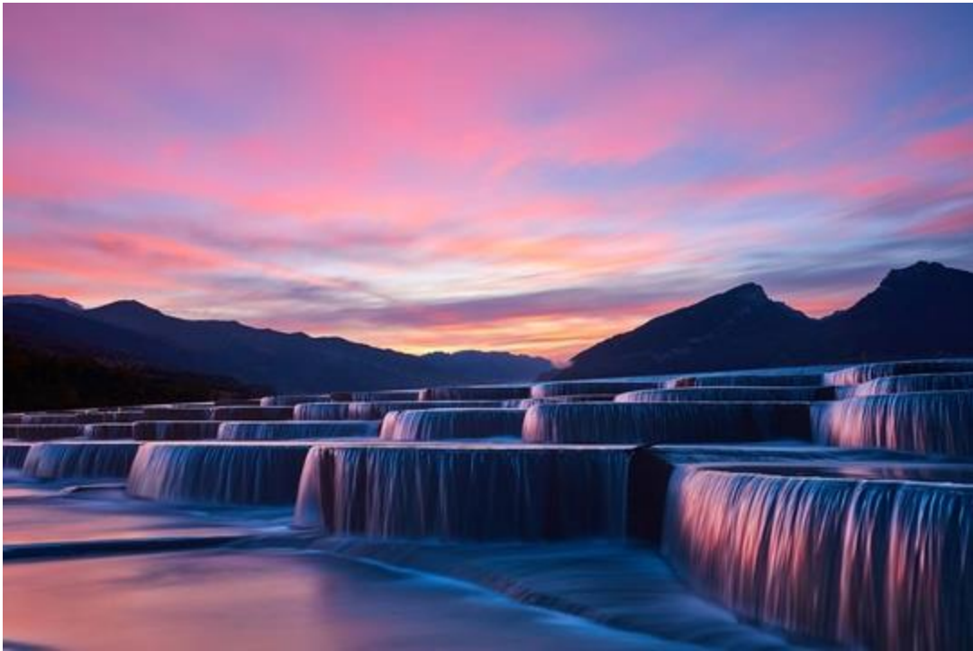
Stepped waterfall group Blue Moon Valley, Lijiang, China