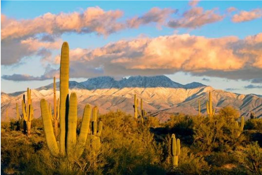
Four Peaks, Gila County, Arizona