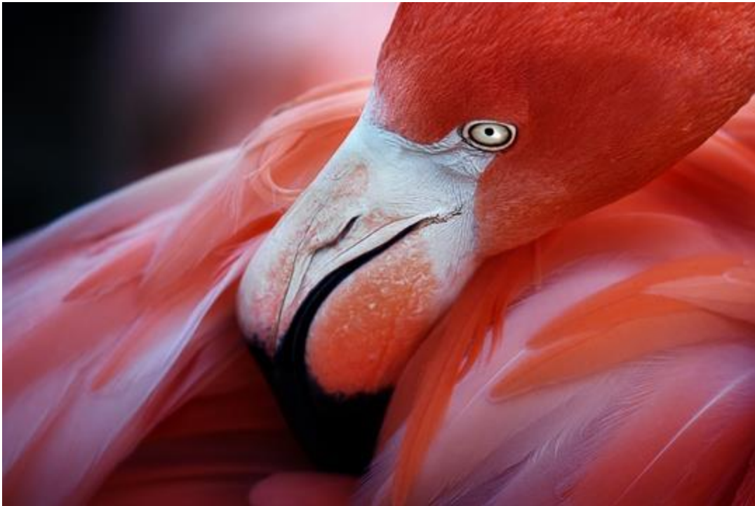
Preening flamingo, Galapagos Islands, Ecuador.