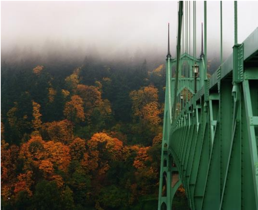
St. Johns Suspension Bridge, Portland, Oregon