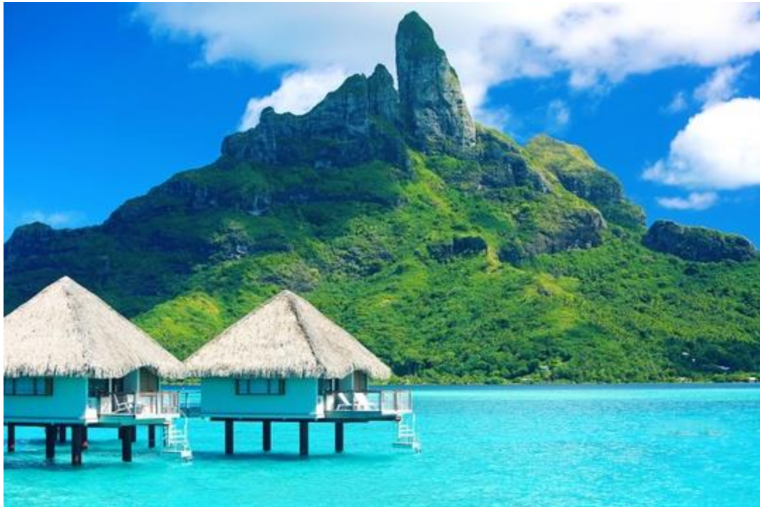
Mt Otemanu, Bora Bora, Tahiti