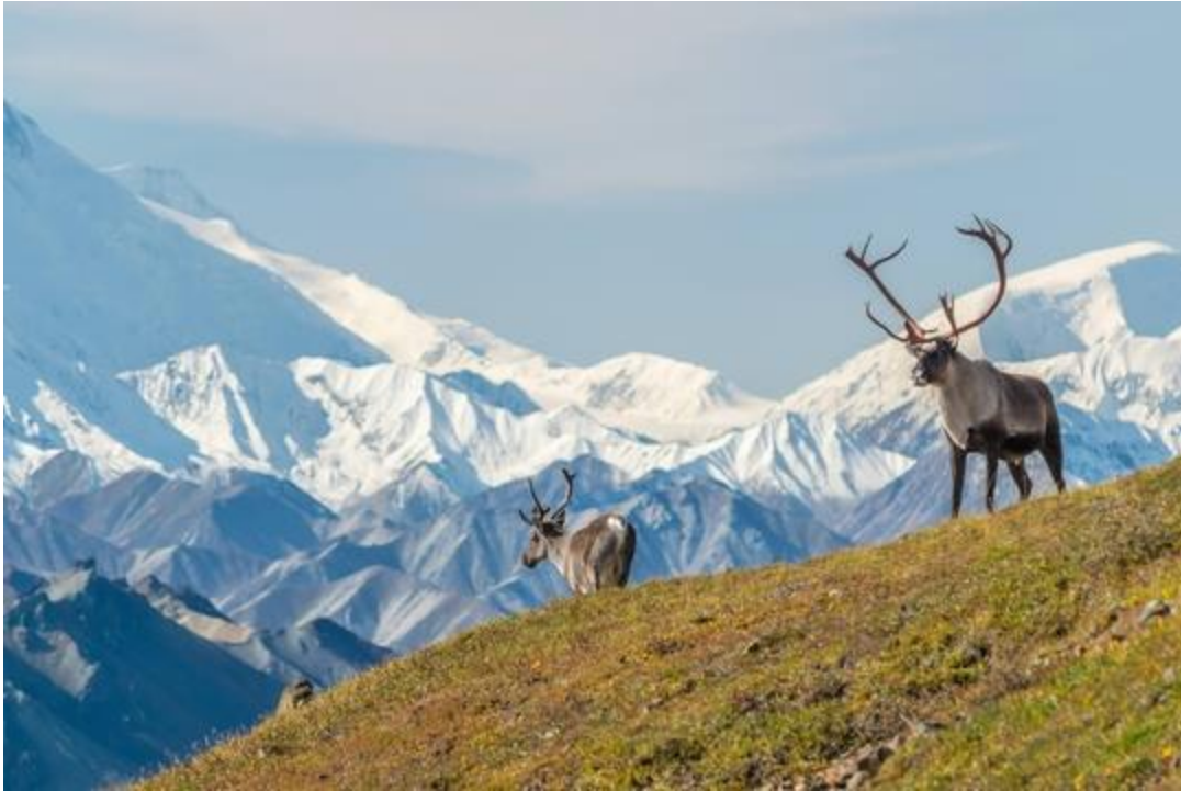
Majestic caribou bull in front of Mount Denali, Alaska.