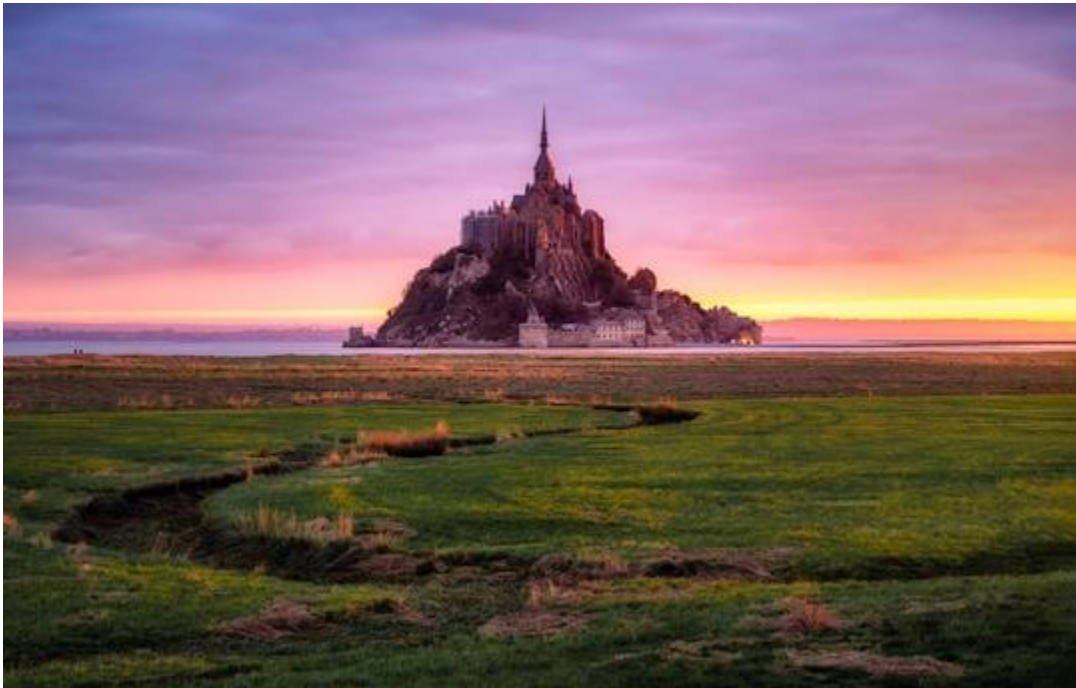
A view of Mont-Saint-Michel at sunrise