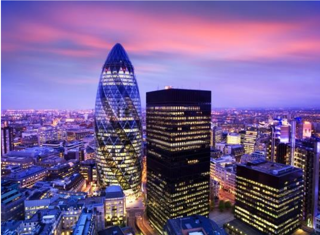
Gherkin, Financial District, London, UK