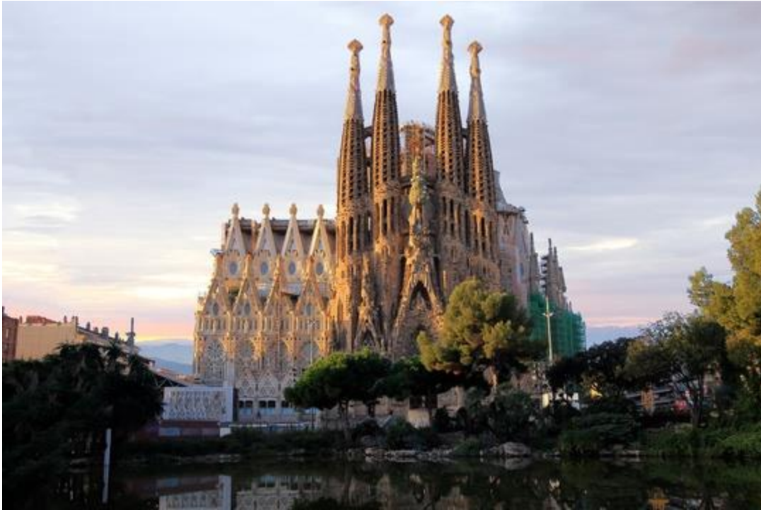
Familia Basilica, Barcelona, Sagrada Familia