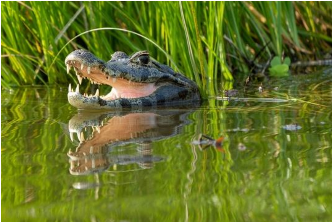
Alligator in the wild, Porto Jofre, Mato Grosso, Brazil