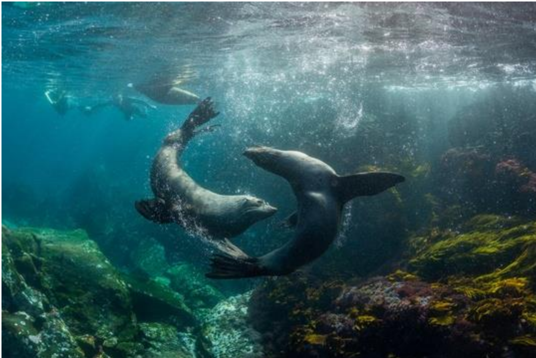
Australian Cape Fur Seals at Play Narooma, NSW, Australia