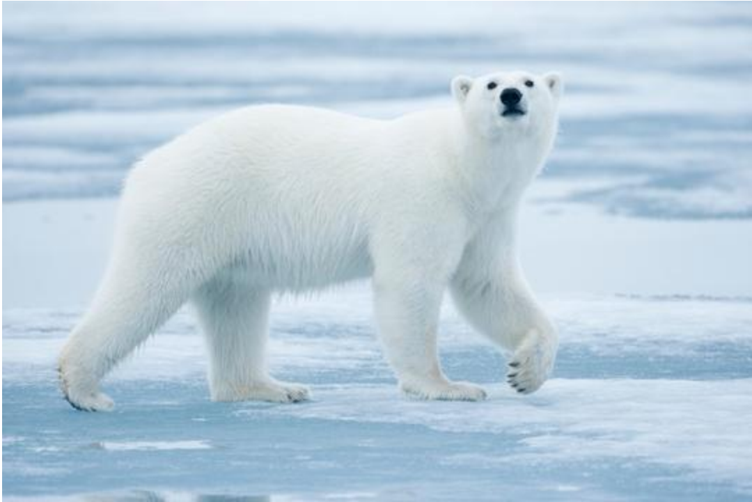
Lady Franklin Fjord Polar Bear Nordaustlandet, Svalbard, Norway